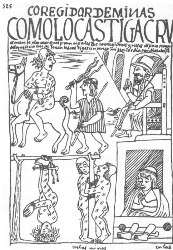
Fig. 3. Corregidor de minas. Catalog of Spanish abuses of indigenous labor force.